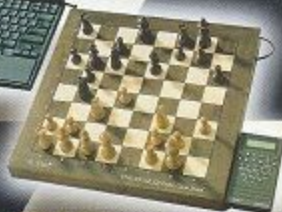
NOVAG Universal board with Sapphire 2 - see page 5 and Novag brochure