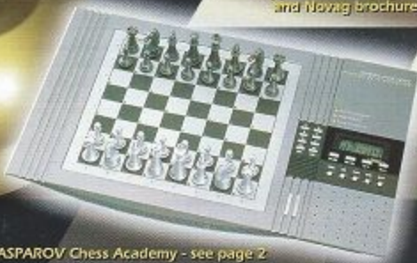
KASPAROV Chess Academy - see page 2

Countrywide Computers Victoria House, 1 High Street, Wilburton, Cambs CB6 3RB Tel: 01353 740323 Fax: 01353 741439